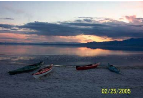
Sunset over the Salton Sea