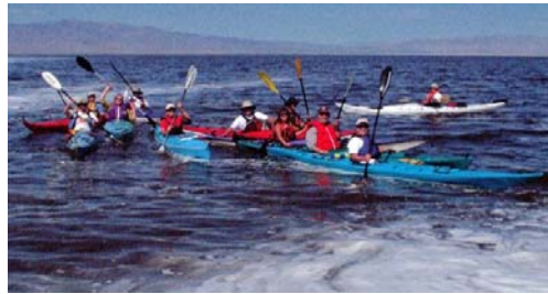
VWKC paddlers at Salton Sea Centennial Celebration, May 7, 2005